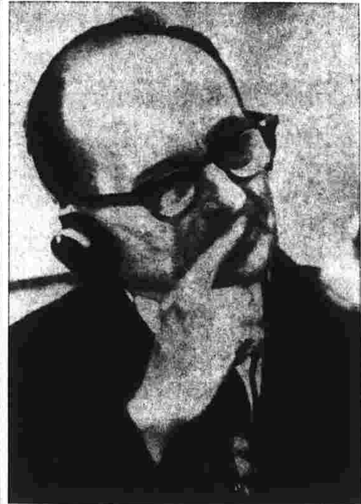
Adolf Eichmann listens attentively as a special Israeli tribunal in Jerusalem calls him guilty as a war criminal.

Washington, Dec. 11 (AP)—Secretary of Welfare Abraham Ribicoff announced today 10 administrative changes in the federal-state public assistance program. He said they are aimed at eliminating abuses, helping people get off relief, and strengthening family life.